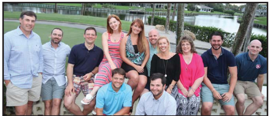
YLP members participate each year in AGC Georgia's Annual Convention. This group participated in the convention at Ponte Vedra Club & Inn in June 2017.