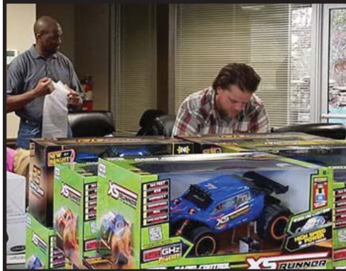
Members proudly take ownership of contributing holiday gifts to 80 children at Hillside Hospital. They also encourage firms to contribute to Toys for Tots.

The program relies heavily on YLP members volunteering their time, talents and energy working together with Council members to implement YLP activities and the ongoing YLP Action Plan. This plan is designed to ensure the quality growth of the program and an outstanding experience for all YLP participants.