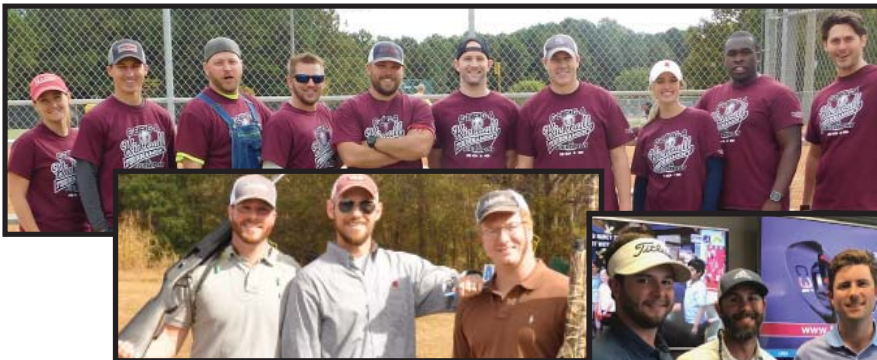
Coordinating our Sporting Clays Tournament & Golf Classic, and participating in CEFGA's kickball tournament are great ways to meet other young professionals.