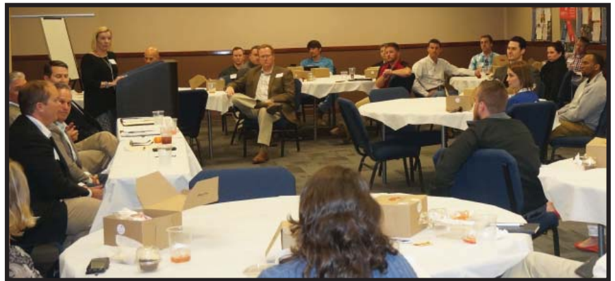
Members serving on YLP’s Council and with the Education Area of Focus (see next page) lead efforts to plan the program’s robust professional development curriculum.

YLP member annual dues support and underwrite most YLP activities throughout the year.