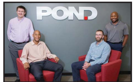
Consider enrolling several team members in YLP and sharing this industry participation with clients and project team members in your company newsletter!